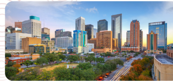
5 Houston, U.S.A.

Guadalajara blends colonial architecture, mariachi traditions, and modern city life with lively plazas, regional cuisine, cultural festivals, and a strong reputation as Mexico's technology innovation hub.