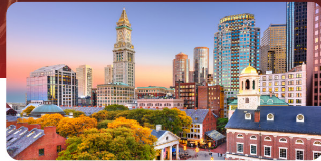
2 Boston, U.S.A.

Atlanta blends Southern culture, major sports history, and modern attractions with walkable entertainment districts, renowned dining, and one of the world's busiest international airports for travelers year-round.