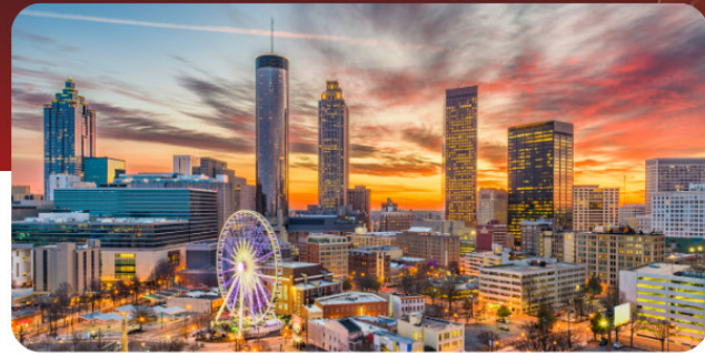
1 Atlanta, U.S.A.

Atlanta blends Southern culture, major sports history, and modern attractions with walkable entertainment districts, renowned dining, and one of the world's busiest international airports for travelers year-round.