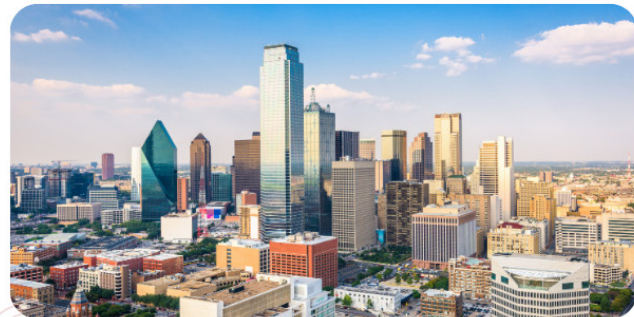
3 Dallas, U.S.A.

Boston combines historic landmarks, passionate sports culture, waterfront scenery, and walkable neighborhoods with renowned universities, seafood restaurants, and easy access to iconic American Revolutionary history sites.