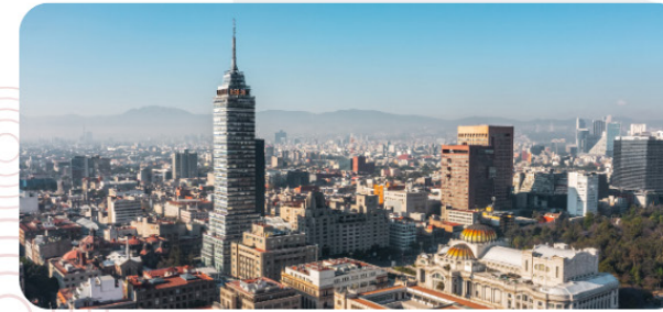
8 Mexico City, Mexico

Los Angeles delivers iconic entertainment, beaches, diverse neighborhoods, and global dining experiences while combining celebrity culture, professional sports, outdoor recreation, and famous attractions across Southern California.