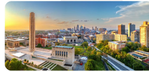
6 Kansas City, U.S.A.

Houston features international cuisine, space exploration history, major sporting venues, and diverse cultural communities while offering visitors renowned museums, vibrant nightlife, and one of America's largest metropolitan areas.