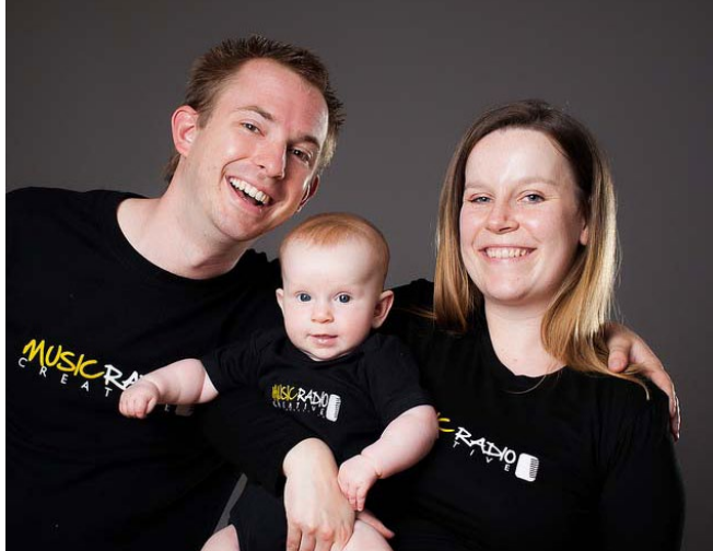
"Music Radio Creative Family" by Mike Russell. CC BY 2.0.

If your family business feels like it is taking away from your ability to be a family, it's time to step back. Maybe you need to hire additional employees who aren't related to you. Maybe you need to close up shop one night a week, even if it cuts into your profit. Make time to step away from your workplace roles and enjoy being