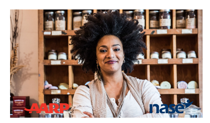
Apply for a NASE Growth Grant sponsored by AARP today. There will be three winners each quarter awarded a $4,000 grant to support the growth of their business.

AARP is committed to supporting older entrepreneurs. AARP is collaborating with the NASE as a supporter of the Growth Grants program . The grants are targeting NASE Members who are minority business owners aged 45 and older. Through this partnership NASE and AARP are working to provide greater access to capital for business growth.